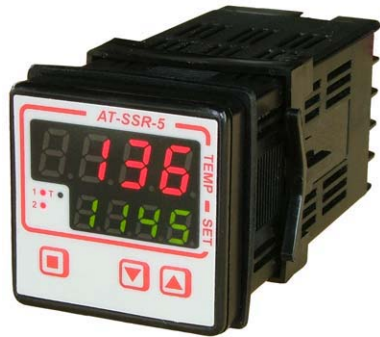
1/16 DIN, Dual Display, 2 Outputs