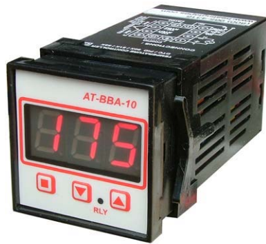
1/16 DIN 3 Digit, °F